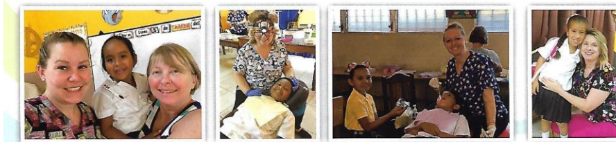
Dental team members with children patients