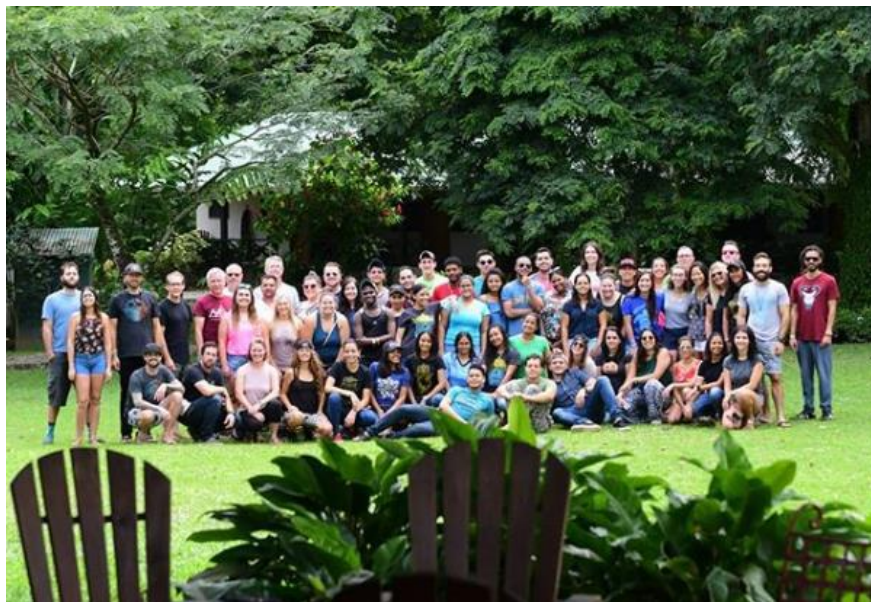
Bright Island Outreach Team in Dominican Republic (2018)